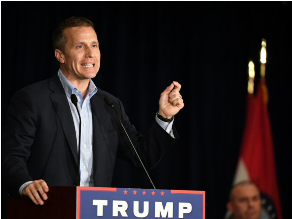
Missouri is a contender for the list of today's most dysfunctional states thanks to sex-and-black-mail allegations against Gov. Eric Greitens.